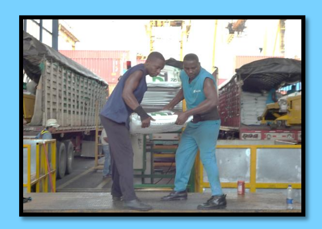
Stevedores loading sugar sacks at the Buenaventura Port, Colombia