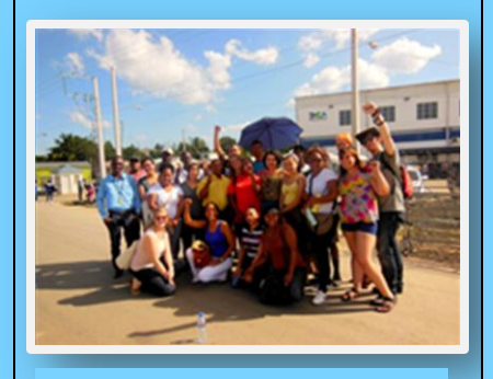
USAS trip to Dominican Republic; photo by Shelby Mastovich