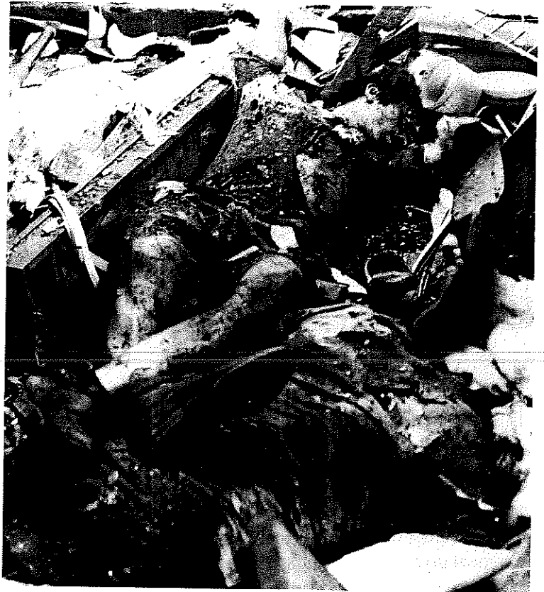
Ten killed, over thirty-eight wounded. Union headquarters after October 1989 bombing.

The reaction was typical. ARENA leader Roberto D'Aubuisson attributed the bombing to the FMLN. Other military