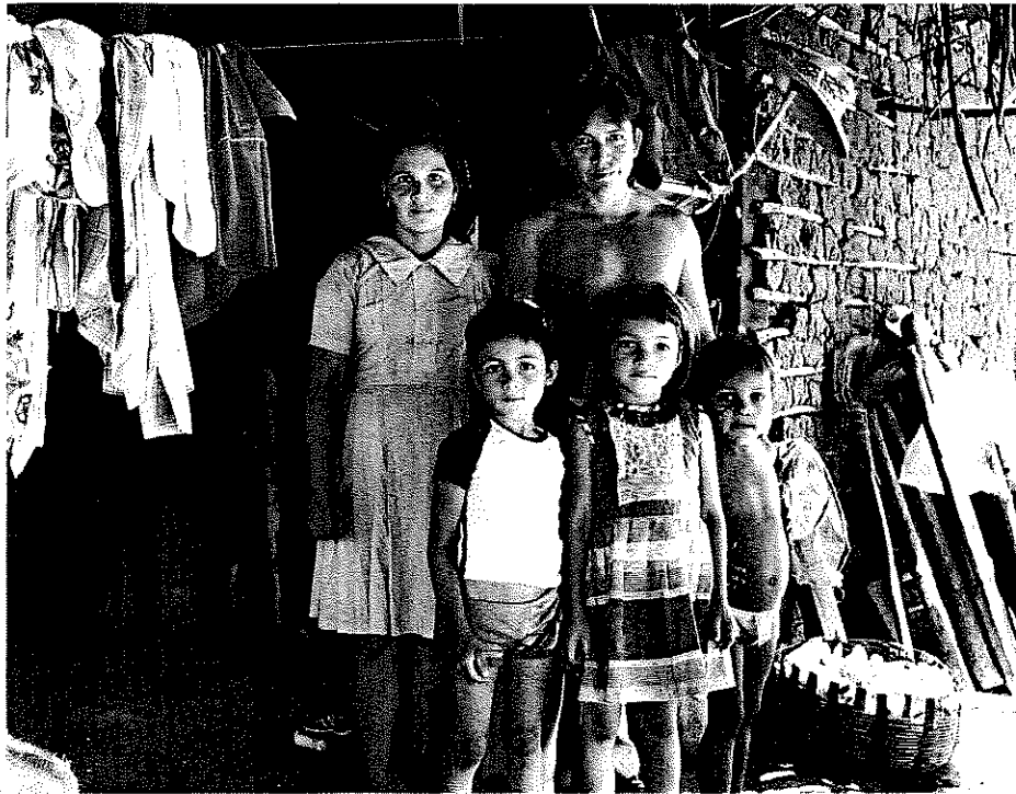
Farm cooperative family on land reform coop.

“The cause of all our ills is the oligarchy, that handful of families who care nothing for the hunger of the people but need that hunger to be able to have available cheap, abundant labor. . . starvation wages. . . and this explains their all-out opposition to any kind of reform or union organizing designed to improve the living standards of the popular sectors.”