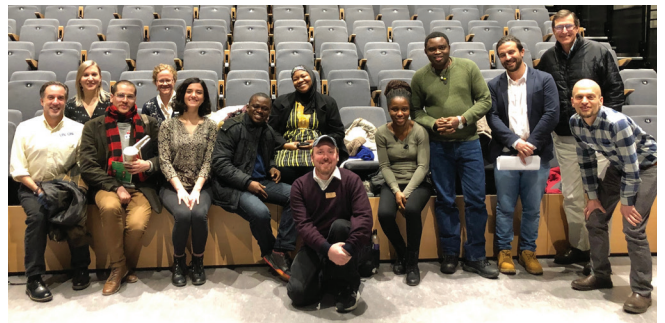
Film series organizers and Penn State faculty and LGWR students on March 19 after a screening of The Second Mother .