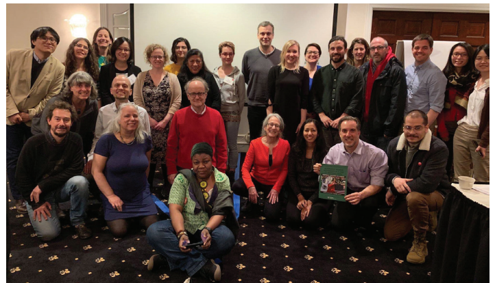
Eighth Annual CGWR Symposium Participants, April 5, 2019.