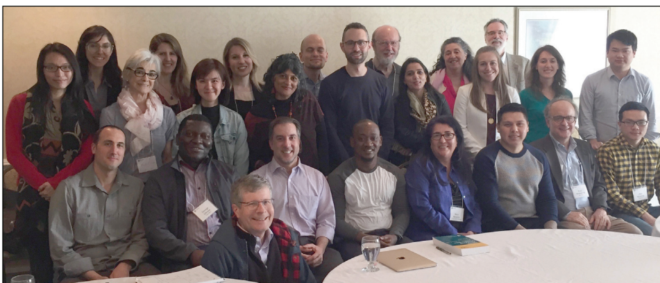
7 th Annual CGWR Spring Symposium Participants, April 2018

Participants explored issues of labor informality for garment and homeworkers, waste pickers, domestic workers, migrant workers, and farm workers across various contexts and countries. Weaving together empirical data, historical narratives, and contemporary reflections on labor informality in comparative perspective, we together asked over the two days: How can workers build power in the informal sector? How can our work, practice, teaching and organizing increase worker protections, standards, and dignity in the informal sector? Moreover, how do we bring about a more just future for all workers?