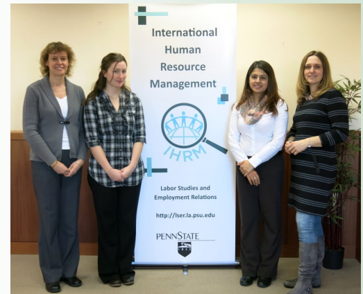
CIHRS CRANET Team

Interested in being involved? Email us at: ihrm@psu.edu .