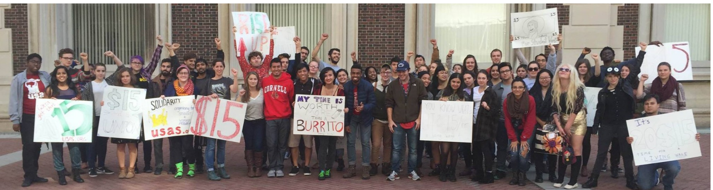
United Students Against Sweatshops - Bootcamp at Columbia University in New York City.

For more information on USAS, visit http://usas.org/