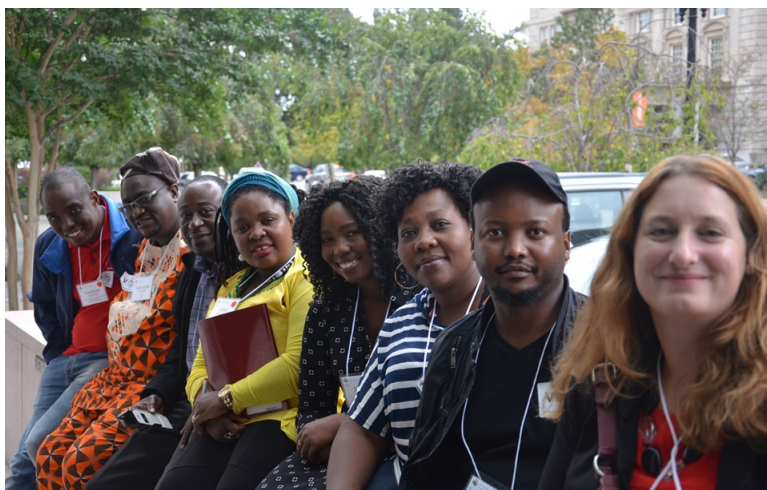
Global Labour University's Participants and Alumni at American Federation of Labor and Congress of Industrial Organization headquarters in Washington, D.C.

Next year's Global Labour University Conference will be hosted by the University of the Witwatersrand in South Africa, and conference hosts have already put out a call for papers. The Center for Global Workers' Rights can't wait to see you there!