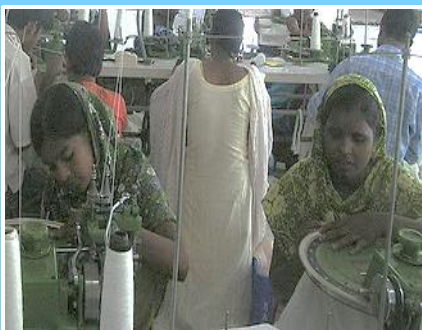
Garment workers Bangladesh