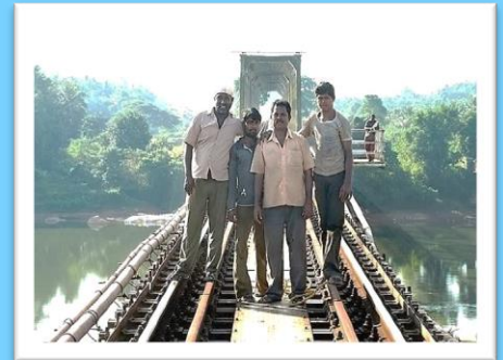
Railroad maintenance workers near Mangalore, India

For events and news, visit our website http://lser.la.psu.edu/gwr/