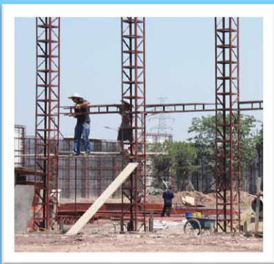
Construction workers in Southwest China

One of the key objectives of the CGWR is to monitor and call attention to attempts by firms or states to violate or make more difficult the fulfillment of workers' rights. Members of the Center have taken part in on the ground research associated with worker freedom and organization as well as general working conditions. To view the report, "The Formalization and Unionization Campaign in the Buenaventura Port, Colombia," by 2012-2013 CGWR Post-Doctoral Scholar Dan Hawkins, visit our webpage: http://lser.la.psu.edu/gwr/index.shtml .